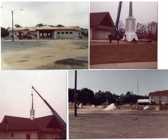
St. John of God under construction Fall, 1982